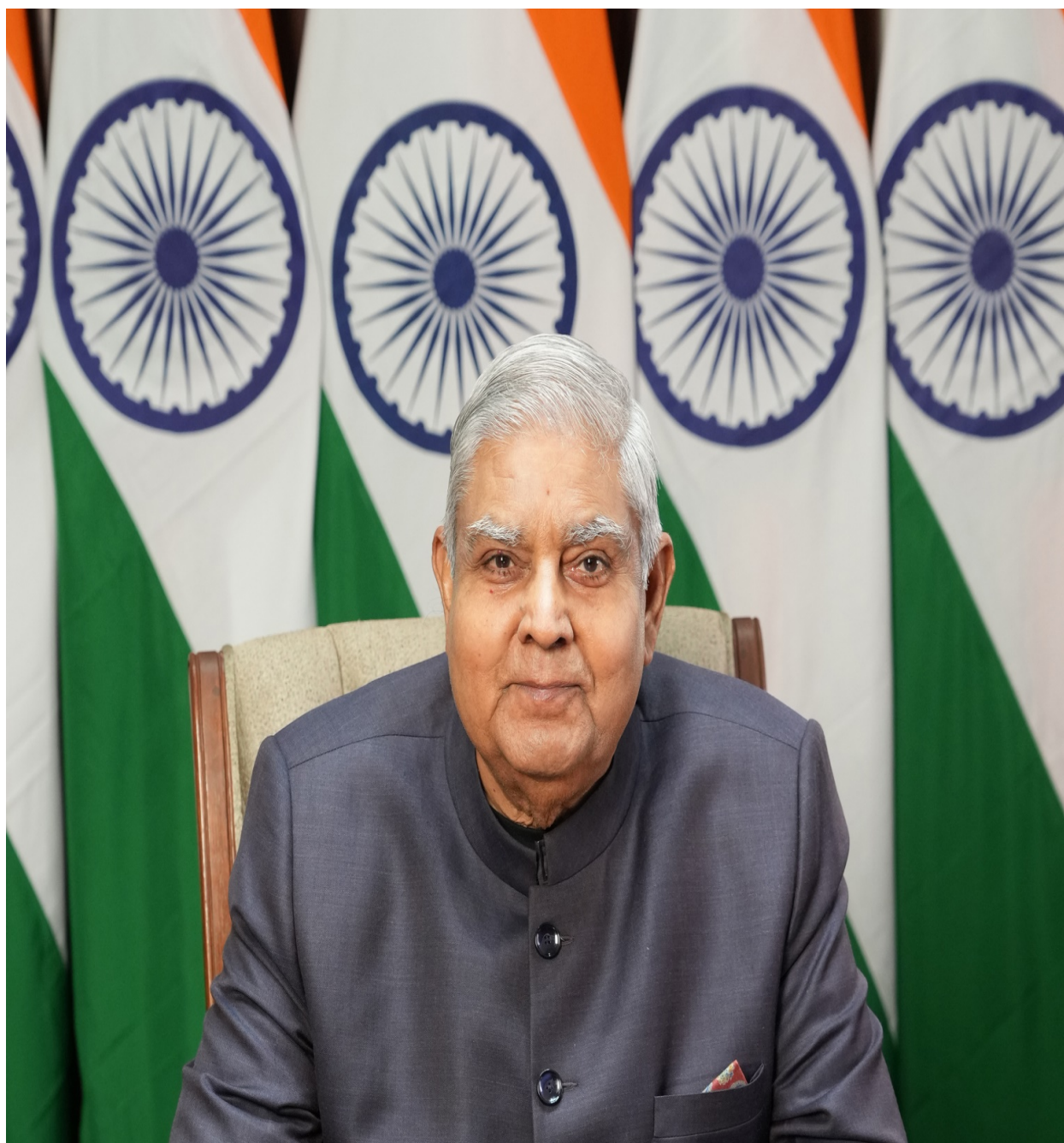
Hon'ble Shri Jagdeep Dhankhar, Vice President of India and Chancellor, Panjab University, Chandigarh